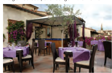
Hotel Bernini Palace

A small deluxe hotel with plenty of charm, character and high levels of personal service. Its central location on the Palazzo Strozzi makes it extremely convenient for sightseeing, within easy reach of the Duomo, Ponte Vecchio, Uffizi gallery and exclusive shopping streets. The Hotel Helvetia and Bristol offers an authentic dining experience in the Hostaria Bibendum where guests can choose from a table in the intimate dining room or outside on the glamourous patio-lounge in the Piazza.