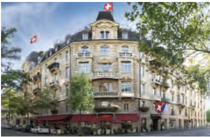
Hotel Ambassador a l'Opera

Surrounded by rolling hills and vineyards the Castel Monastero in Chianti offers an authentic Tuscan experience in the elegant surroundings of a converted monastery. Now a hotel with 74 rooms and suites the hotel has not lost its sense of tranquillity or rustic charm. With a wide range of spa facilities and also cookery courses and wine tasting the hotel truly appeals to those looking for a traditional Tuscan experience.